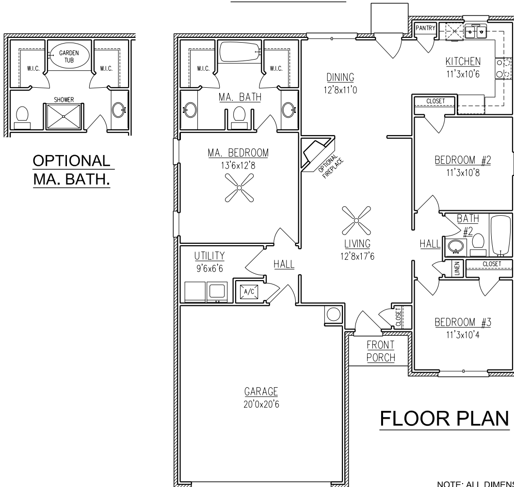
OPTIONAL MA. BATH.